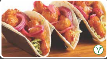
Sweet Chili Cauliflower Taco Battered sweet chili cauliflower, coleslaw, pickled onions