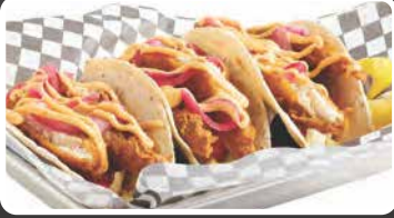
Fish Taco Battered Haddock, lettuce, tomato, pickled onions, chipotle mayo