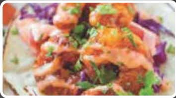
Diablo Shrimp Taco Voodoo Inferno beer battered shrimp, coleslaw, corn salsa