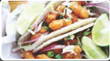
Crispy Thai Shrimp Taco Tangy Thai beer battered shrimp, bell peppers, green onion