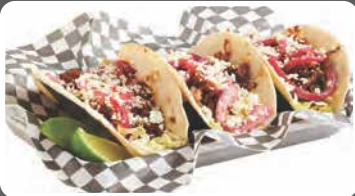
Slow Cooked Pork Taco Tex-Mex pulled pork, coleslaw, pickled onions, feta