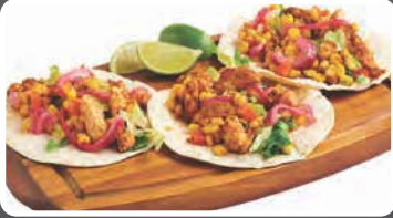
Tex-Mex Chicken Taco Tex-Mex grilled chicken, lettuce, corn salsa, pickled onions, guacamole